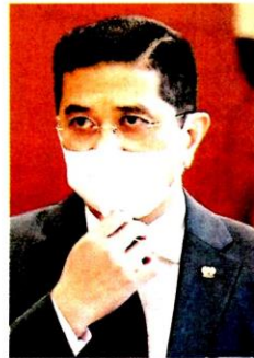
Pic by Mohd Amin Nisharul Azmin says companies that have registered with CIMS will not need to re-register

MITI Minister Datuk Seri Mohamed Azmin Ali said the SOPs will enable the smooth flow of operations and ensure effective implementation of Business Continuity Plan (BCP) during the MCO that begins today until Jan 26, 2021. "The government's decision to allow five essential economic sectors — including manufacturing to operate — is to ensure the country's economic recovery process, business sustainability, avoid high unemployment rates among Malaysians, and to ensure that people continue to gain access to basic and critical necessities, throughout