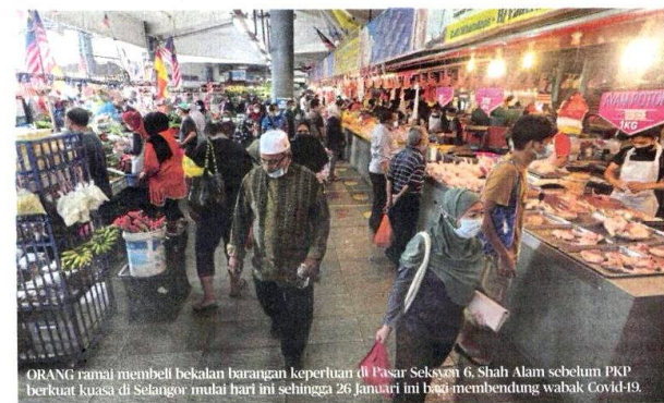
ORANG ramai membeli bekalan barangan keperluan di Pasar Seksyen 6, Shah Alam sebelum PKP berkuat kuasa di Selangor mulai hari ini sehingga 26 Januari ini bagi membendung wabak Covid-19.

"Pendaftaran hanya terpakai untuk syarikat dalam sektor pengilangan dan pembuatan di bawah seliaan Miti malah majikan bertanggungjawab memuat turun surat notifikasi pengesahan pendaftaran untuk membolehkan pergerakan pekerja dalam tempoh PKP," katanya.