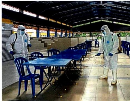
MPKL personnel disinfecting the Pasar Awam Banting in Jalan Sentosa. The council says it disinfects all public markets twice weekly. (Right) MBSA enforcement officers checking on SOP compliance at a shop in Shah Alam.