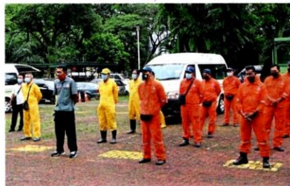
The teams from DBKL and Kuala Lumpur Fire and Rescue Department being briefed before a sanitisation exercise in Kuala Lumpur. (Right) MPAJ's Covid-19 task force focuses on sanitising high touchpoint areas such as playgrounds.