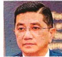
Mohamed Azmin Ali

Mohamed Azmin berkata, antara pertimbangan penting yang turut diambil kira oleh kerajaan adalah keperluan menjamin kestabilan aktiviti eksport negara. "MITI yang bertanggungjawab ke atas pembangunan dan perkembangan aktiviti industri, perdagangan dan pelaburan negara juga sentiasa terbuka menerima pandangan dikemukakan persatuan industri dan dewan perniagaan," katanya. Beliau berkata, pandangan industri penting bagi bantu kerajaan capai keseimbangan antara perlindungan kesihatan dan keperluan menjaga serta merangsang semula sektor ekonomi. "Hasil libat urus dan kerjasama dengan persatuan industri, dewan perniagaan dan pihak berkepentingan lain, MITI merangka SOP komprehensif, relevan dan praktikal. "SOP ini akan membantu kelangsungan operasi serta pelan kesinambungan syarikat dan in-